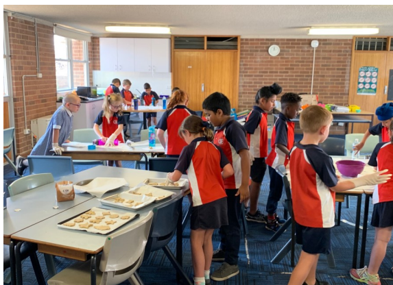
1/2 Blue making gingerbread for the volunteers morning tea.

Thank you to all of the parents who attended the SRC Thank You Morning Tea. We are truly appreciative of all the support you have given our students, staff and school in 2019. We look forward to seeing you again in 2020.